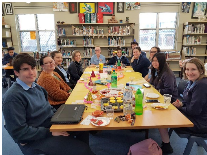
Farewell morning tea for some of our Year 12 students

Meanwhile, we are farewelling out current Year 12 cohort. To all of those students who we have worked with this year, as well as over the last six years, at EPHS, we wish you the best of luck with your HSC exams and for what lies ahead.