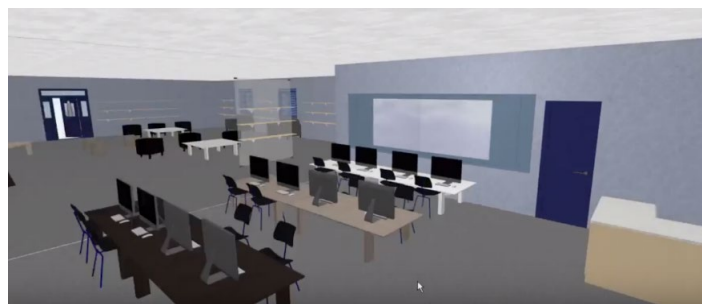
New library design created on Planner 5D

In term 2, Year 7 completed the "Ersko Block" project. Students in two large groups, chose their roles and designed ideas a team. Students nominated to renovate the demountables and library, constructing new and creative designs for each area.