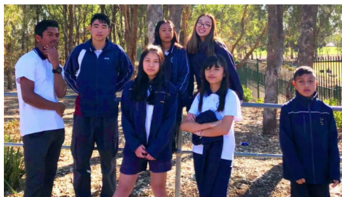
Tournament of Minds Team

Also happening in the gifted and talented program, our tournament of the minds team have been working hard completing their long term STEM challenge. Students have been creating their working model and will present their project at Western Sydney University (Kingswood) on Sunday 26th of August.