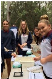
Year 11 Biology excursion to Longneck lagoon