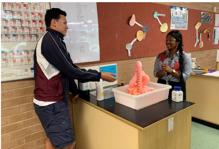
Miss Asokan's 10.5 Science class watching demonstration of a decomposition reaction